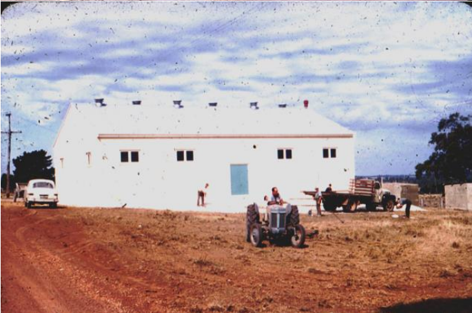
Building the Memorial Hall from 1953 to 1956