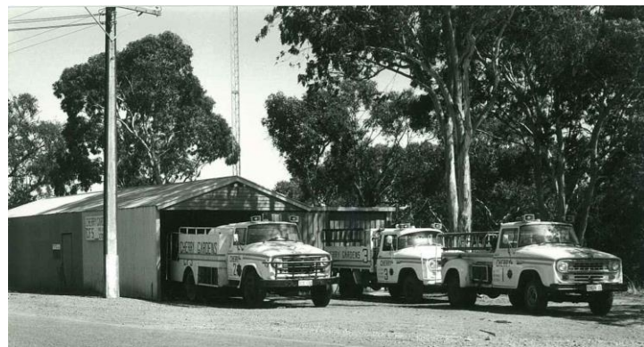
The old CFS Shed with Bedford Trucks