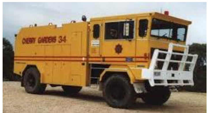
The RFW that came from the Woods and Forests Department in around 1994