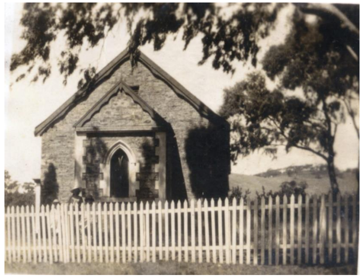
A view of the Cherry Gardens Church in 1935