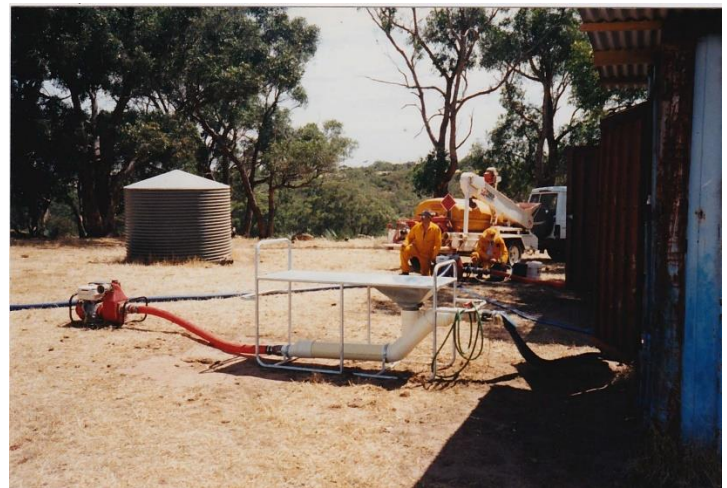
Manning the pumps