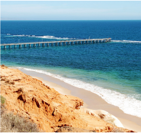
Port Noarlunga, potential location for a shellfish reef.