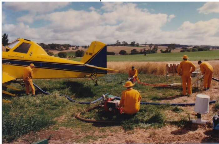
Loading an Aircraft