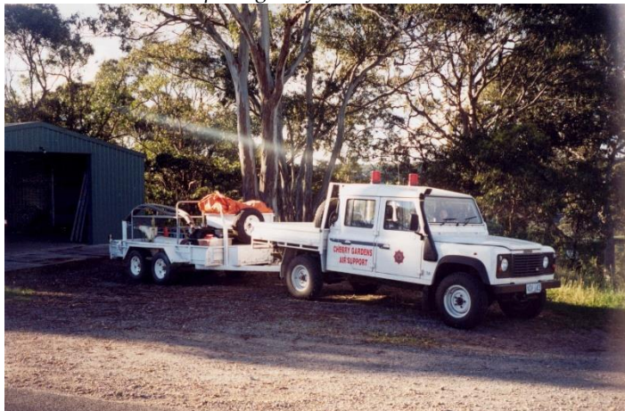
The Air Operations unit