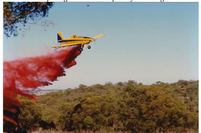
Dropping a load of retardant