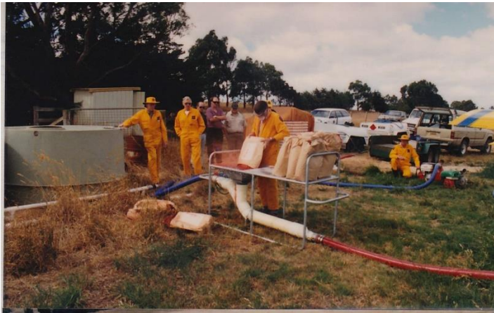
Preparing the fire retardant

Some more photos of the early years with Air Operations and Cherry Gardens brigade.