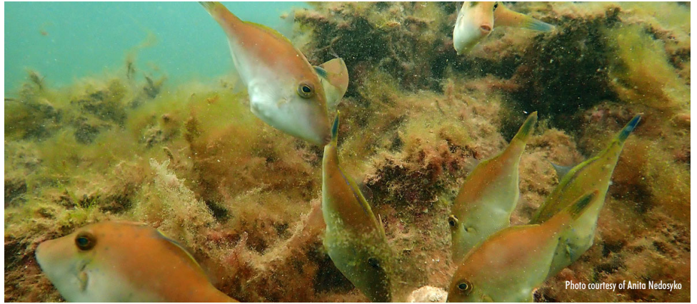
Leatherjacket fish at the Windara shellfish reef on the Yorke Peninsula.