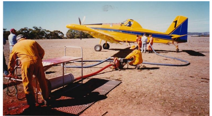
Filling one of the early "Bombers"