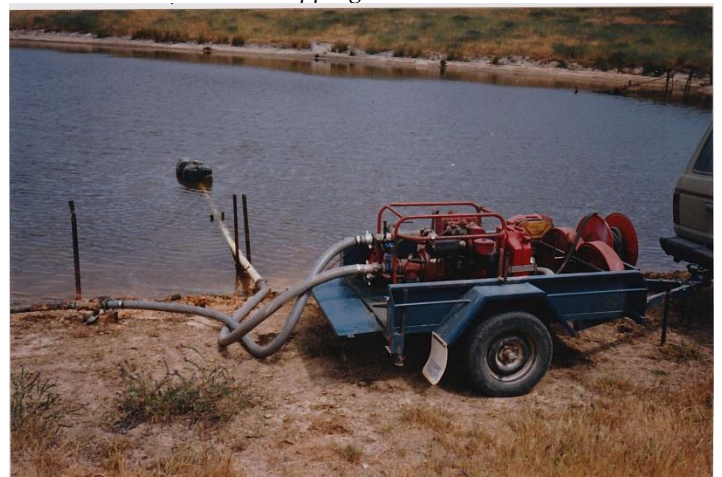
Pumping water from the DAM to refill storage tanks