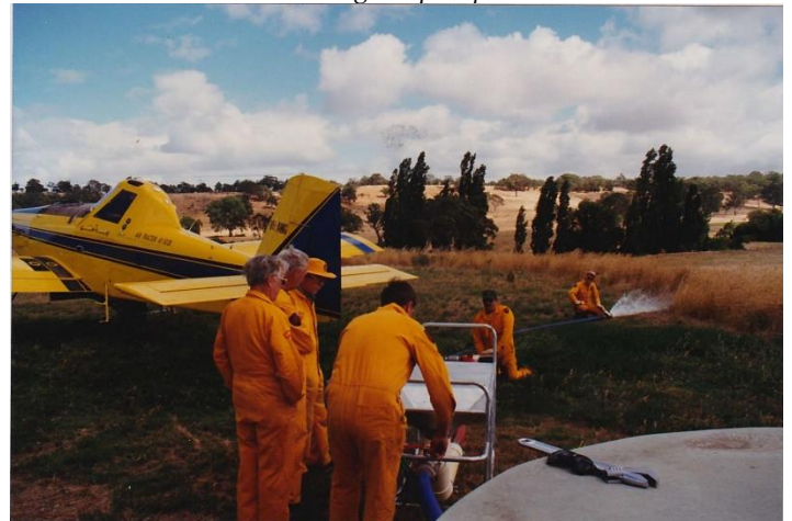
The Retardant Mixer