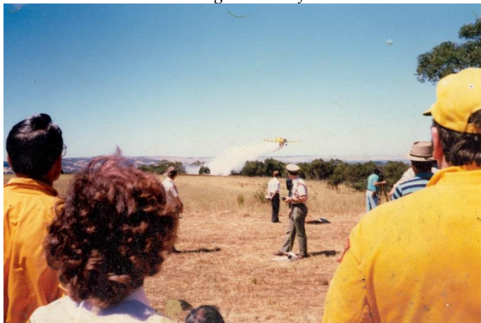
Observing Aircraft dropping a load of Foam & Water