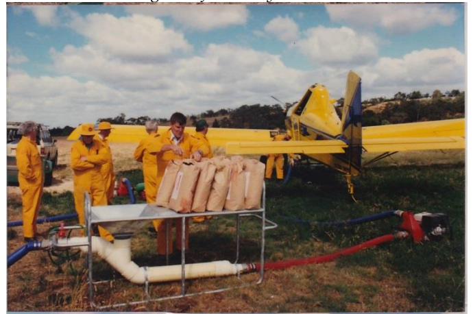
Preparing the retardant packs for mixing