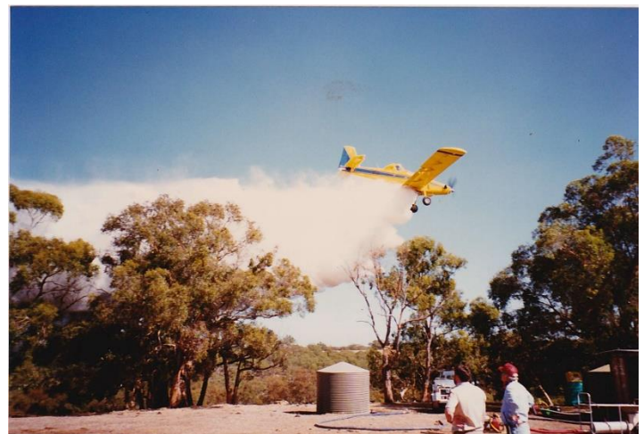
Dropping a load