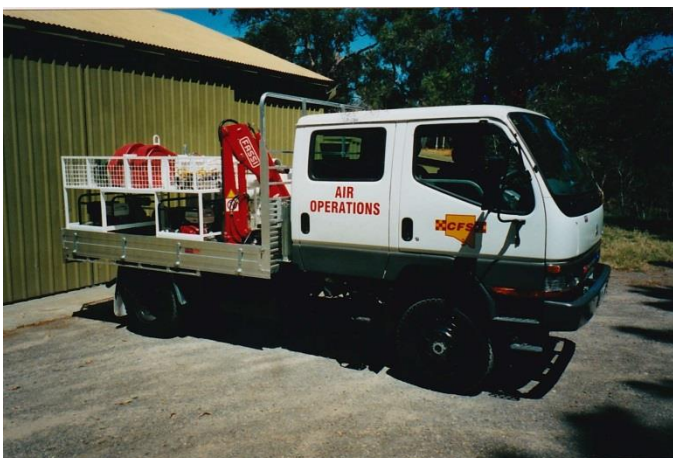
One of the Air Operations vehicles

Here are a few photos from the early days.