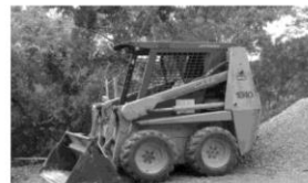
SKID STEER LOADER