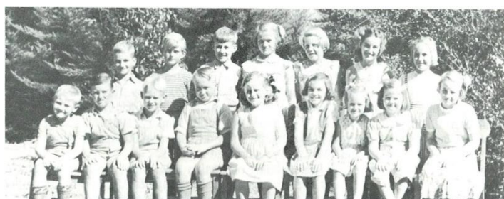
Cherry Gardens School about 1955