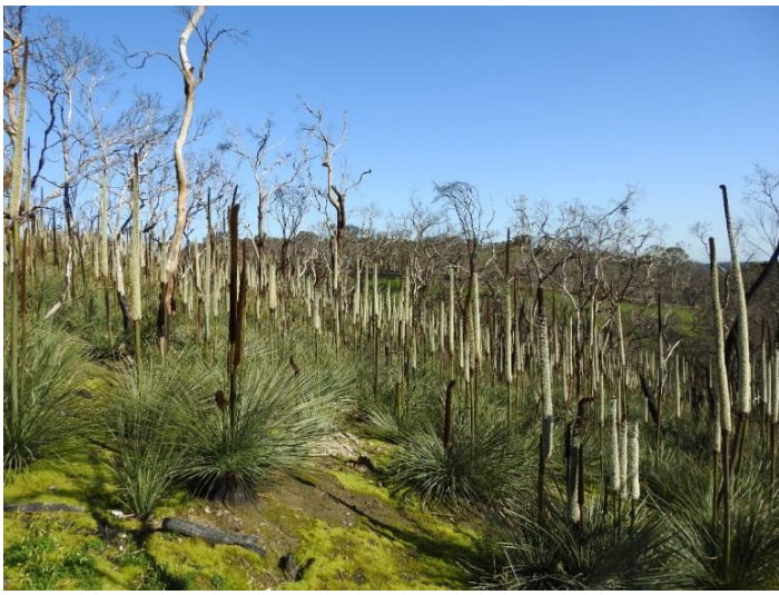
A spectacular display of flowering Yacca