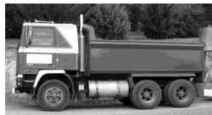
TANDEM TIPPER HIRE