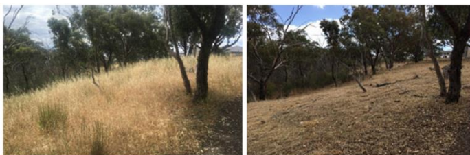
Before and after slashing work in Sturt Gorge Recreation Park

At the time of writing, the summer bushfire season has started in Cherry Gardens. We would ask everyone to review their fire safety plans; be familiar with any firefighting equipment you may depend on and consider any fire risks with any outdoor work or activities. The council has started with a roadside vegetation slashing programme which is welcomed. The height and density of grasses throughout the area currently is a concern – please ensure this fuel load is reduced where possible. Grassfires with a heavy fuel load will burn rapidly and have a flame height between three to five times the height of the fuel. With the topography of Cherry Gardens these fires could be almost impossible to control. Although it is never too late, if you still have areas to carry out fuel reduction be mindful of the risk of starting fires during this process – the grass is now fully cured. Consider the two images of the same area below. If a fire was to take hold in the grass shown in the left-hand photo, it could be impossible to bring under control. By contrast, in the same scenario in the right-hand image should be straight forward to manage.