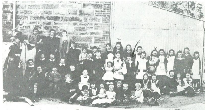
Cherry Gardens School c1885

With the school year just finished a few photos from the Cherry Gardens School that was down Hicks Hill Road.