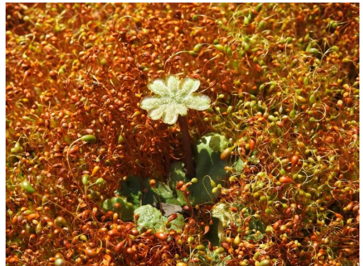
The spectacular colours of mosses and liverworts

Tue 1 Bushcare Sat, Sun 5, 6 Bird banding Sun 13 Bushcare Sat, Sun 19, 20 Bird banding Sat 26 Bushcare