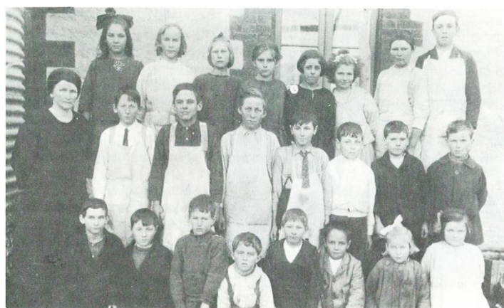
Cherry Gardens School about 1924