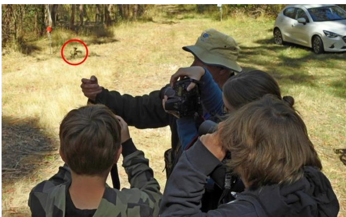
Our paparazzi taking photos of a Buff-rumped Thornbill being released after banding in February

In addition, there has been a lot of work done in the unburnt western side of the park, where more Montpellier Broom and the highly invasive Bluebell Creeper, a garden escapee from WA, has also had a very good year.