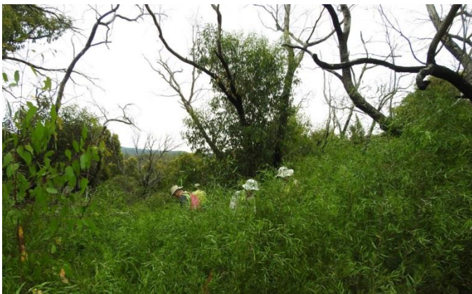
Some of our volunteer bushcareers hunting for English Broom and Tree Lucerne amongst regrowth Varnish Wattle

While regeneration of native species has continued to benefit from the mild and wet years we have had since the fire, the same can also be said for many of the priority fire responsive weeds we have been working on. These continue to germinate throughout large parts of the park, whether in concentrated areas where previous large infestations occurred, like Montpellier Broom, English Broom and Tree Lucerne, or scattered isolated plants like Boneseed.