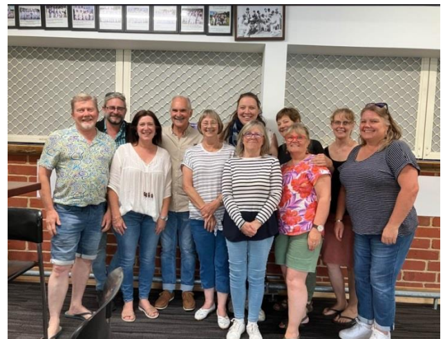
The Cherry Chatter Committee

Thank you so much again, to everyone who contributes to, and supports the Cherry Chatter newsletter each month, as well as all the volunteers across the broader community who help make this an amazing place to live.