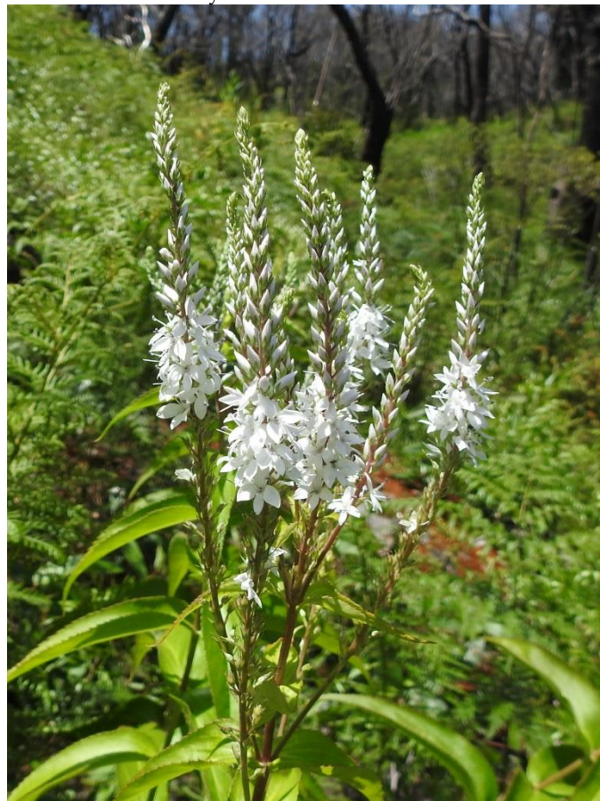
The Nationally Critically Endangered Mount Lofty Speedwell will be propagated by the Seed Conservation Centre and planted back into the park.

wild-fire, although two more smaller plants have been found more recently.