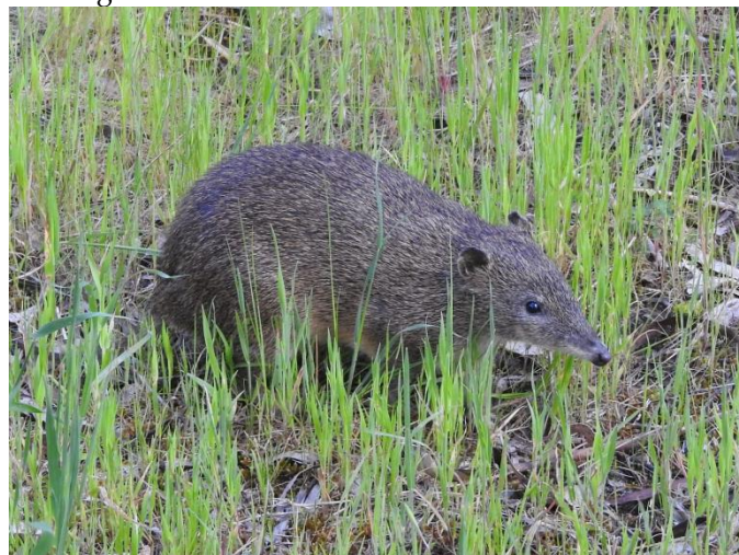
The Nationally Endangered Southern Brown Bandicoot will have habitat restored as part of the partnership grant.

We had been discussing the way forward with funding, as we have pretty much exhausted the grant funding we received over the last year, and are just about to start on the donated monies. Funding contractor support over the next few years is going to be critical in maintaining our momentum and keeping our priority weed management under control, so this three year grant funding is essential.