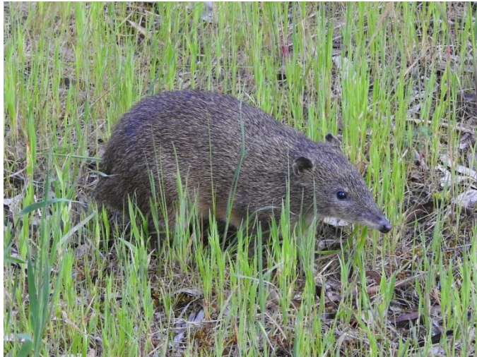
A Southern Brown Bandicoot in the park near the edge of the January fire.

Sat, Sun 4, 5 Bird banding Tue 7 Bushcare Sun 12 Bushcare Sat, Sun 18, 19 Bird banding Sat 25 Christmas