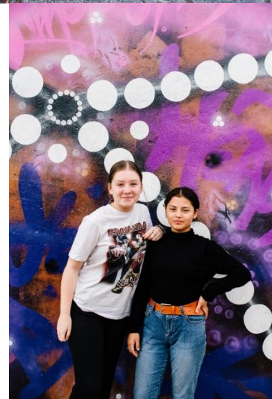
All images are of our program participants who have consented to share their photos in the promotion of Youth Opportunities