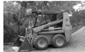
SKID STEER LOADER