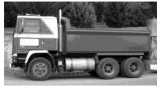
TANDEM TIPPER HIRE