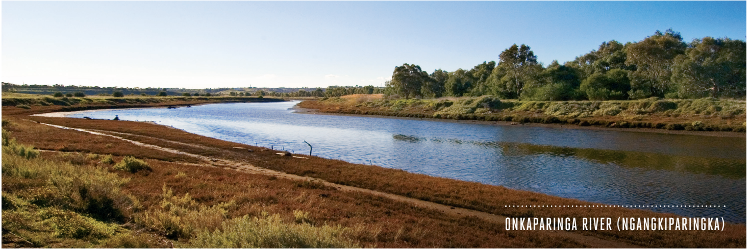
ONKAPARINGA RIVER (NGANGKIPARINGKA)